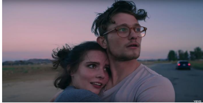
“Sleep on the Floor” The Lumineers . Vevo, 2016. Screenshot

hear this message that’s being thrown into society’s scope repeatedly. It’s found within the flashes of novels, movies and song lyrics. For instance, The Lumineers’ music video for their well-admired song, “Sleep on the