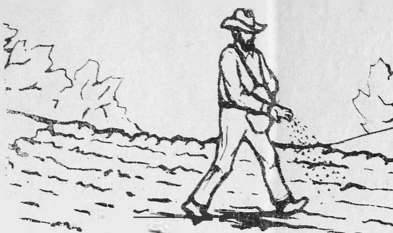
—South Range Ranch, Mansfield, Mo.

I will content myself with a minimum of things conducive to a clean, comfortable and efficient abode. Counter advertising.