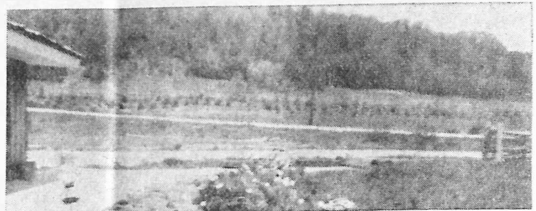
LOOKING into the hills from Candle Lights terrace.

rangements. On a hillside in an old orchard, with gorgeous view of the lake, is land available in one to five acre plots for as little as $100 an acre. These have lake (Traverse Bay) access, with a public beach less than a mile away. Other acres on a road and with a building, are higher, on a lease arrangement, with lease money applied on any later sale. Her hope is that a group would be able to use the build-