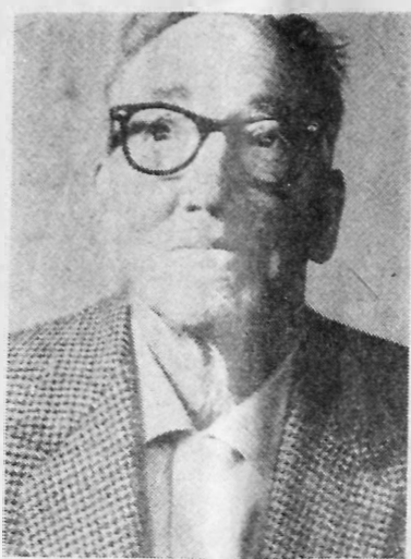
Vardis Fisher Self-Portrait at 70

[Note: Other members and trustees will be heard from next month.—Editor]