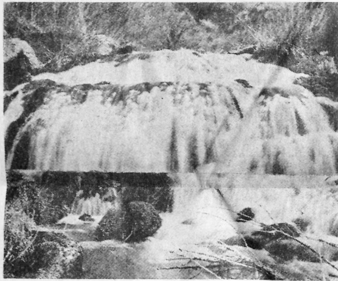
A lovely small waterfall, fed by a group of springs.

Vardis Fisher has written more than 30 novels of tremendous emotional power and extraordinary learning. While novels of any author do not appear frequently on my reading list. I greatly regret that it wasn't until a few years ago that I came to know of Fisher's novels. His Man of the Mountains and Orphans of Gethsemane have shown me that he is a man attuned to nature and to liberty; in fact, a Man , whom it has been our loss not to know much longer. Mr. Fisher has contributed important ideas to recent issues of our A Way Out , and we're proud to have him as a friend of the School of Living.