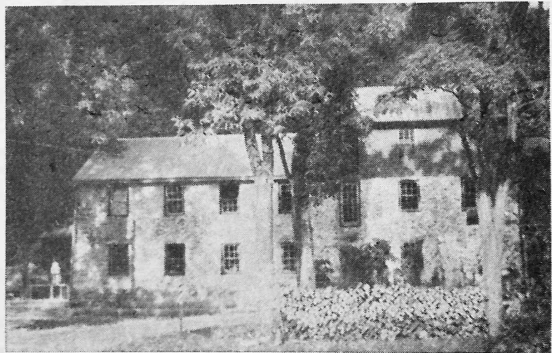
Heathcote Mill, Built 1800

Let all School of Living members share with their friends our big news of a new Center. Let this picture help convey the sturdy values, the strength of handwork, the beauty of the countryside, and the education for the good life to which it will be dedicated this coming Jan. 1, 1967.