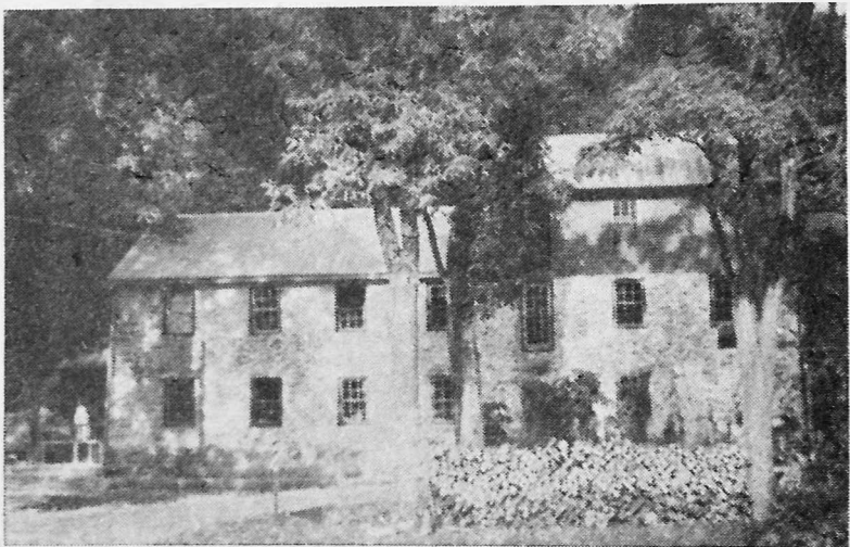
Heathcote Mill, Built 1800

Let all School of Living members share with their friends our big news of a new Center. Let this picture help convey the sturdy values, the strength of handwork, the beauty of the countryside, and the education for the good life to which it will be dedicated this coming Jan. 1, 1967.